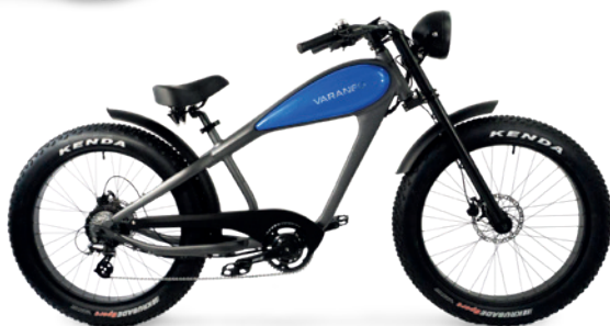
anthracite blue metallic