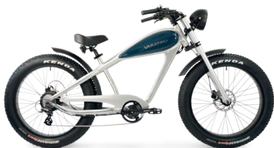
brushed aluminum ocean blue